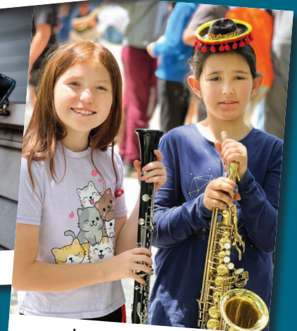
Intro to Instruments