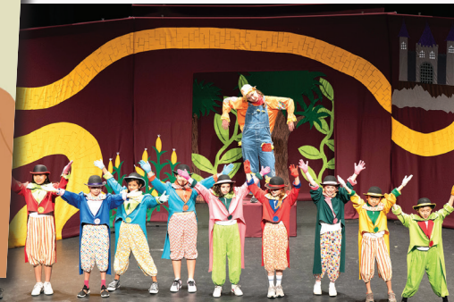
Musical Theater Camp