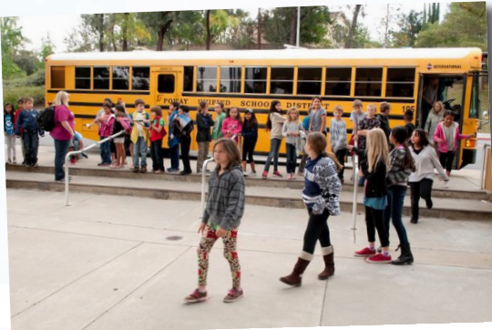
ArtsEd OnStage: Bus-In Field Trips